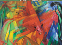
2 Playground 49625 Romeo Plank Rd Animals in a Landscape , Franz Marc