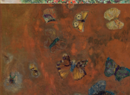
4 Butterfly Garden 49625 Romeo Plank Rd Evocation of Butterflies , Odilon Redon