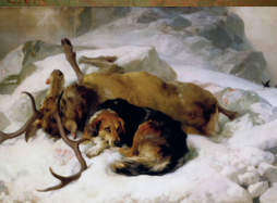
6 Dog Park 49625 Romeo Plank Rd Chevy , Edwin Henry Landseer