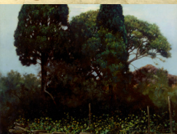
8 Seating Area 49625 Romeo Plank Rd The Garden of the Villa Costello , Capri Charles Caryl Coleman