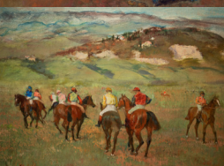
5 Walking Path 49625 Romeo Plank Rd Jockeys on Horseback before Distant Hills Edgar Degas