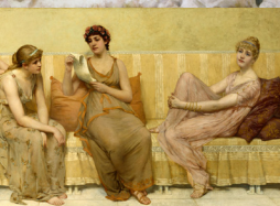
7 Pergola 49625 Romeo Plank Rd Reading the Story of Oenone , Francis Davis Millet