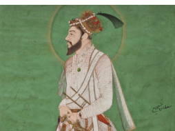
1 Pickle Ball/Tennis Courts 49625 Romeo Plank Rd Portrait of a Mughal Prince Unknown Artist, Islamic